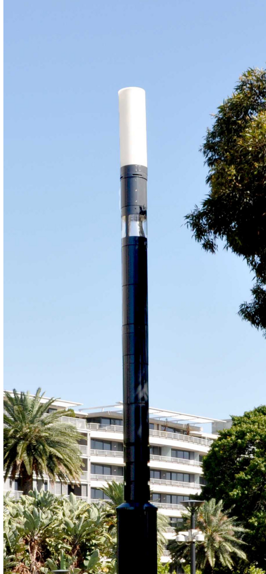
ROYAL BOTANIC GARDEN, SYDNEY