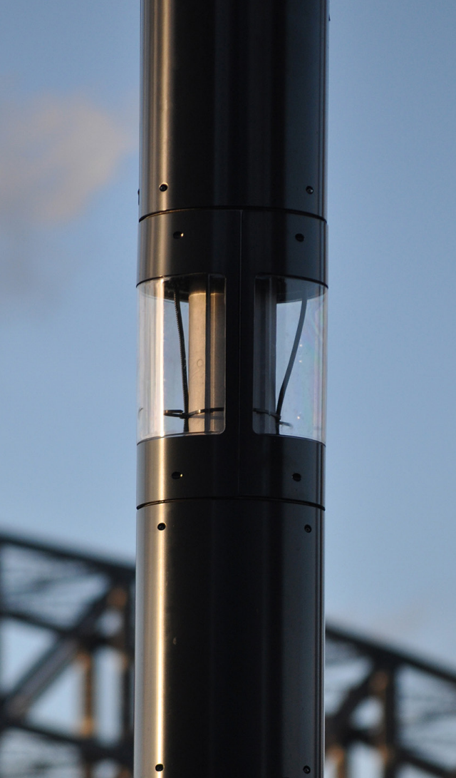
ROYAL BOTANIC GARDEN, SYDNEY