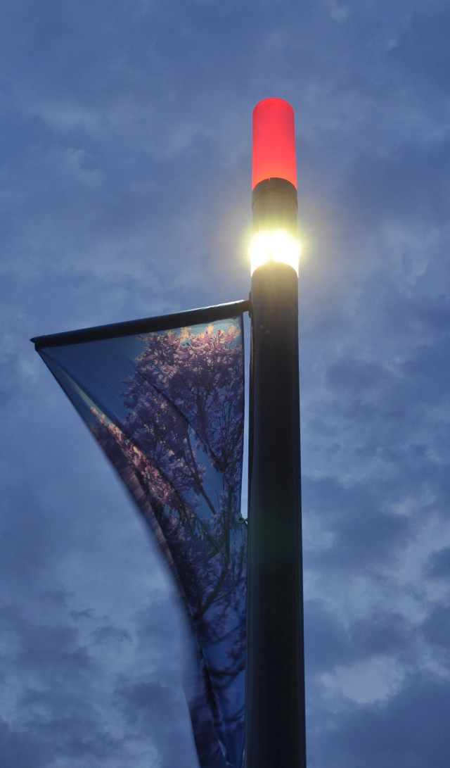
WEST HOLLYWOOD, LOS ANGELES