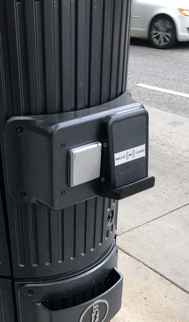
WEST HOLLYWOOD, LOS ANGELES