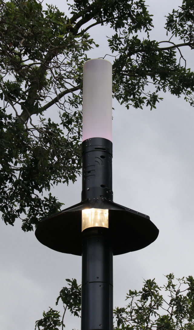
THE MILL, MORETON BAY