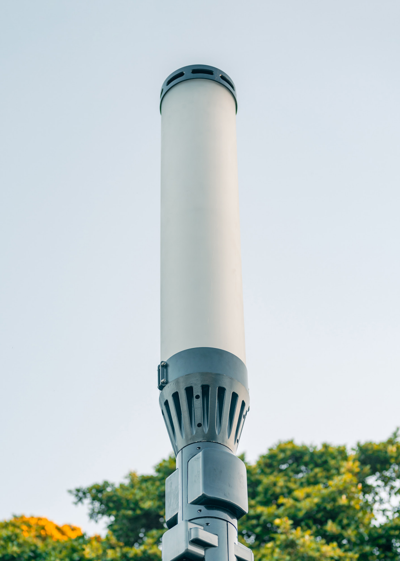
GOODWILL BRIDGE, BRISBANE