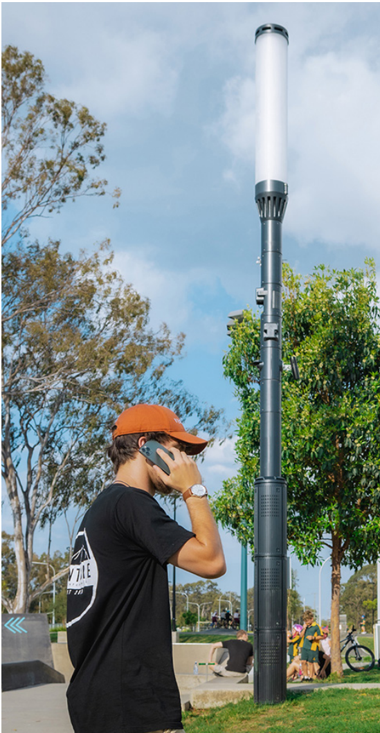
BRACKEN RIDGE, BRISBANE