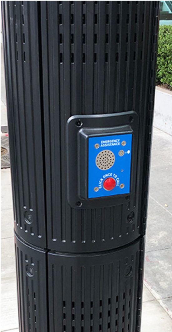
WEST HOLLYWOOD, LOS ANGELES