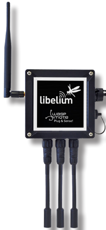
WASPMOTE PLUG & SENSE! WITH SENSOR PROBES