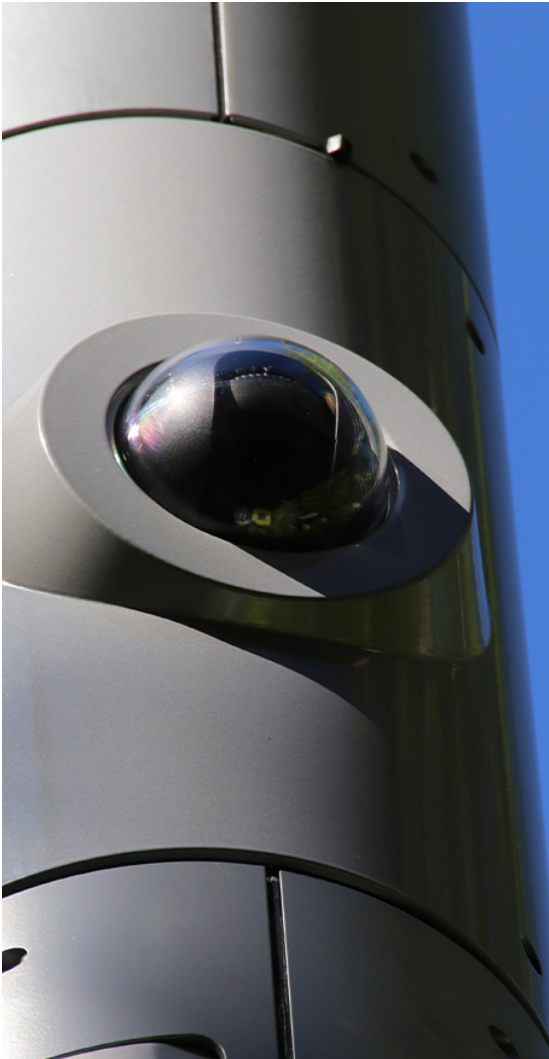
'FUTURE STREET', SYDNEY CBD