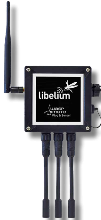
WASPMOTE PLUG & SENSE! WITH SENSOR PROBES