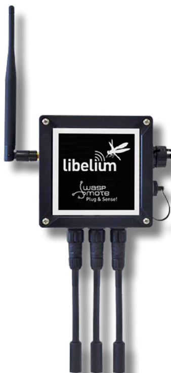
WASPMOTE PLUG & SENSE! WITH SENSOR PROBES