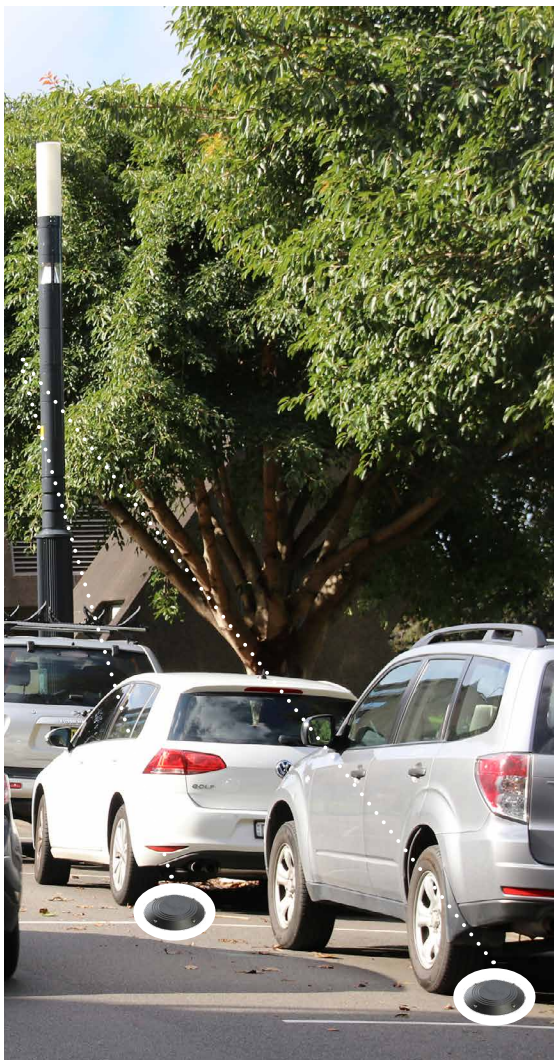
ROYAL BOTANIC GARDEN, SYDNEY