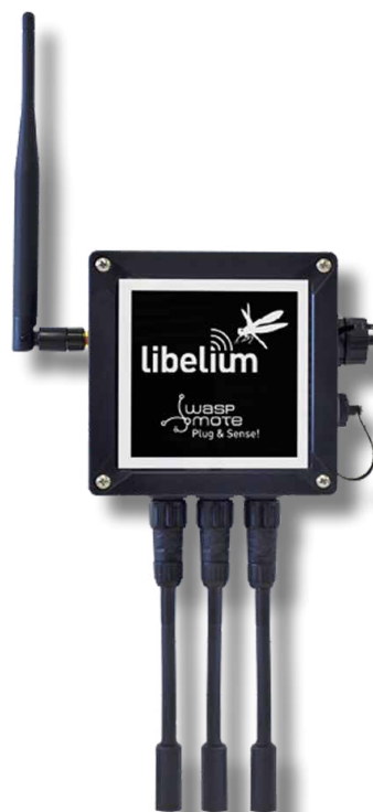
WASPMOTE PLUG & SENSE! WITH SENSOR PROBES